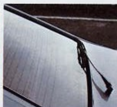
Keep your rear view vision crystal clear with the Capri third door wash/wipe.