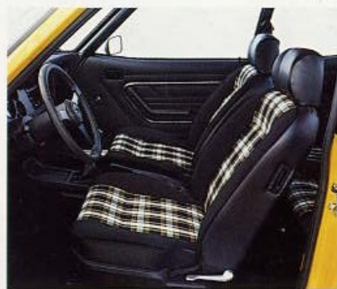
Recaro seats and seat belts are optional at extra cost on the Ford Capri S

Inside, the Capri 'S' has comprehensive, glare-free instrumentation that includes a tachometer with trip recorder, engine temperature, oil pressure, fuel and battery charge gauges. And all this is housed in a modern 'soft-feel' black fascia set off with a distinctive grey bezel. To make the 'S' even more special, you can now specify Recaro sports seats. These seats are specifically designed to give improved side and back support and the recline is infinitely adjustable. The open mesh head restraints not only improve rear view vision but make the car seem airier.