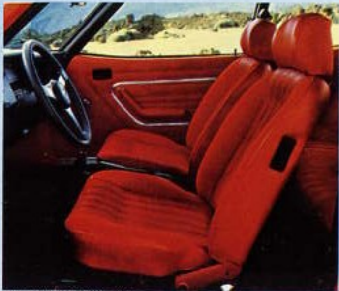
Interior Ford Capri L

The Capri L may be the least expensive Capri but it's still handsomely endowed with a generous list of features. For example: on the outside the Capri gives you sporty road wheels and a distinctive body side stripe. On the inside there's new cloth seats that adjust to your ideal driving position: a fully-fitted black carpet, new instrument graphics, a 'padded' grey facia and a sporty soft-feel three-spoke steering wheel. All three column-mounted