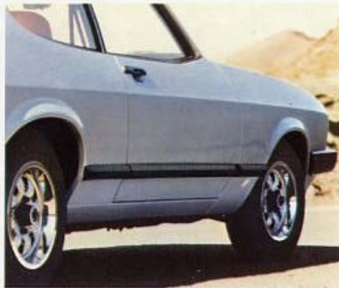
The protective body side moulding strip on the Ford Capri GL.

The Capri GL gives you all the sportiness of the Capri with even more luxury. Open the door, with its protective lower body side moulding, to the luxury of diamond cloth reclining front seats and padded armrests. Look around and you can see all those touches that can add so much to motoring: a lamp in the luggage area, a useful rear package tray that keeps your baggage safely out of sight, an equally useful centre console that takes all your odds-and-ends, a hand-brake warning light, clock, and a color co-ordinated interior. Those together with the car's extra sound-proofing make the Capri GL a grand luxury tourer.