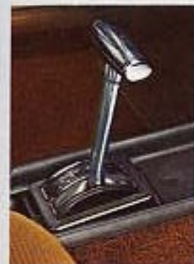
Automatic transmission can take the strain out of stop-start driving without giving up Capri's sporty performance.