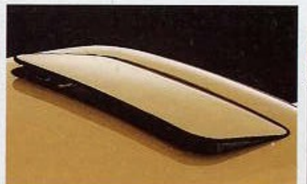
The tilt slide roof lets in the sun when its bright, adds extra ventilation when its not.