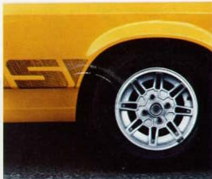
The sporty alloy roadwheels on the Ford Capri S

In keeping with the Capri's new sporty lines the 'S' has a lively yet economical 1.6 litre engine as standard. Should you want more power there's the smooth, powerful 2.0 litre V6 and the breath-taking 3.0 litre 138 HP V6 that accelerates from 0-100 km/h in 8.6 seconds. And the handling is equally impressive. The fine-tuned suspension promises you superb roadholding on even the tightest curves. And an aerodynamic front and rear spoiler brings the drag factor down to an incredible 0.374 to give you improved high speed stability and lower fuel consumption. And so nobody should be in any doubt about the fact that you drive the sportiest Ford in Europe there's a distinctive wide graduated 'S' side stripe and rear badging, bumper overriders and alloy roadwheels. Everything on this Capri says sports with a capital 'S'.