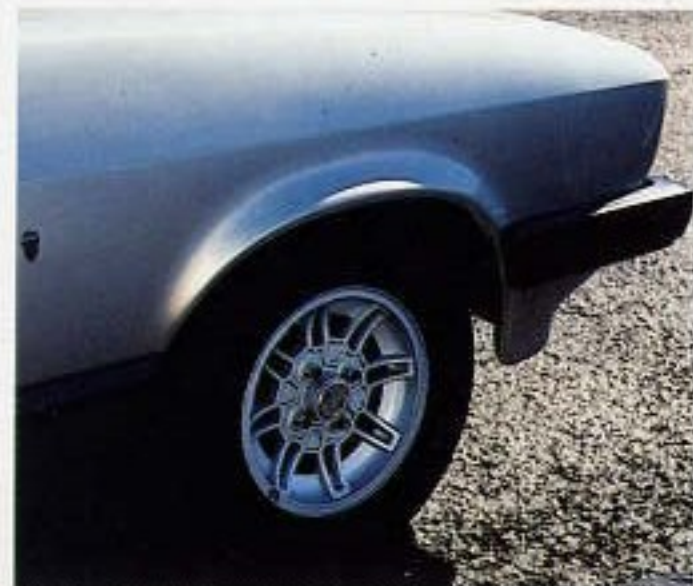
Alloy roadwheels on the Ford Capri Ghia

The influence of Ghia of Turin is immediately evident in this Capri. Refinements such as specially designed thick luxurious seats with integral adjustable front head restraints, concealed inertia reel seat belts, and the fullest instrumentation, reveal the care with which the interior was designed. A spacious center console, housing a clock, forms a comfortable armrest between the front seats. You can even operate the door mirror from inside the car and clean the third door glass with the rear wash/wipe. Opening rear quarter windows, color keyed cut-pile carpet, black cut-pile carpet in the load compartment, luxury padded interior walls and doors, rear arm rests, and a leather covered steering wheel completes the Ghia luxury. The Capri Ghia is simply a car that won't be compromised.