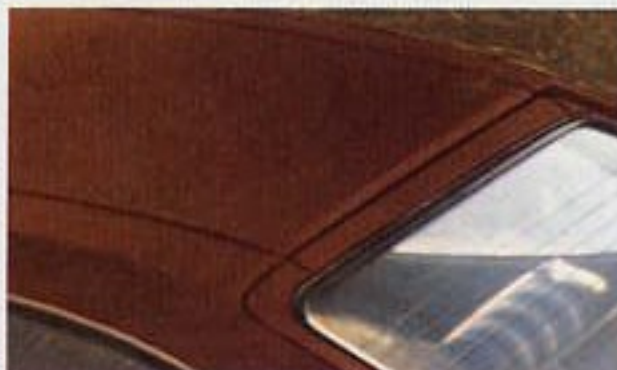
The stylish vinylroof.